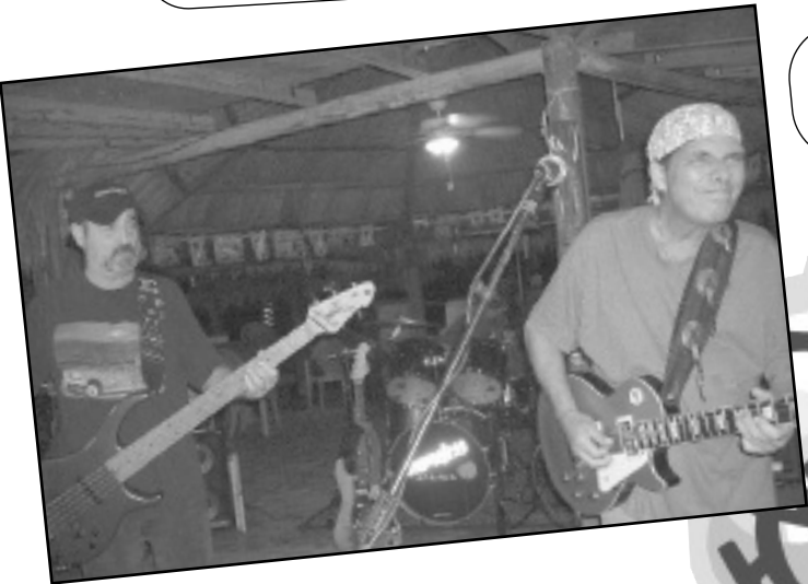
J K Project at Gilbert's.