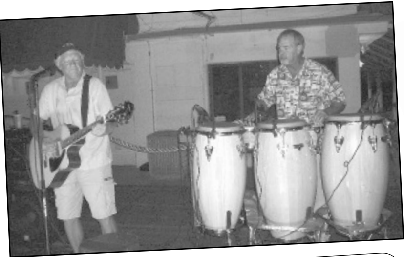
Marley's Restaurant at Jewfish Creek rocks!