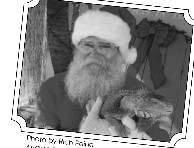
ABOVE: Santa and his friend at Keys Kritters "Pets and Pina Coladas."

If you have pictures of fun and interesting goin's on in and around the Keys just send 'em along to The Coconut Telegraph@yahoo.com