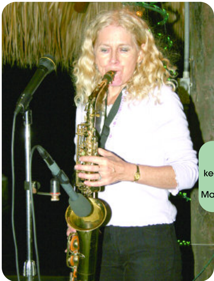
RIGHT & LEFT: The Rockabilly's keeping the customers entertained at the Mandalay in Key Largo.