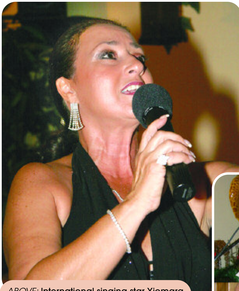
ABOVE: International singing star Xiomara performing at Picchi's Restaurant in Islamorada.