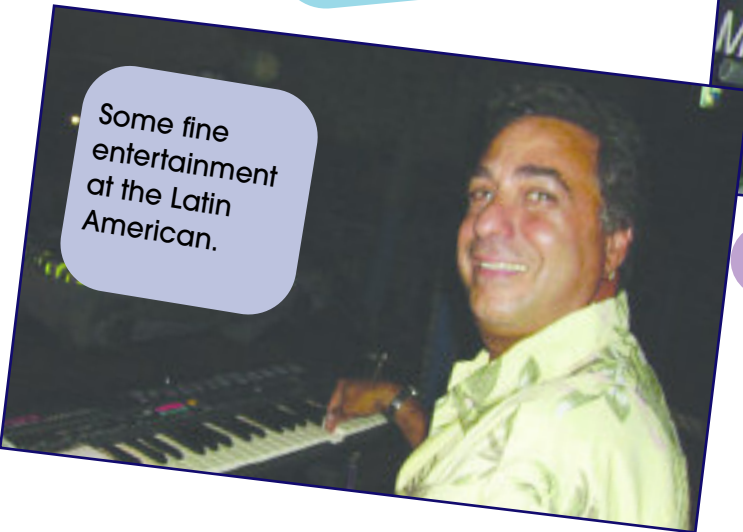
Some fine entertainment at the Latin American.