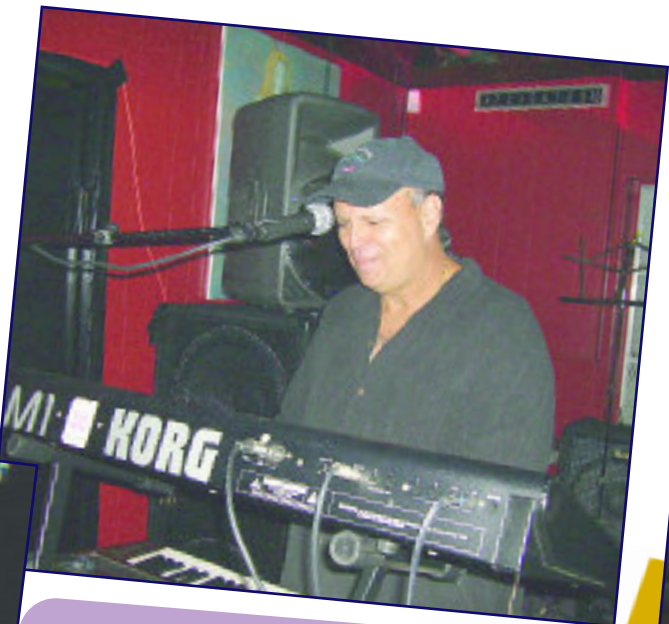
Viva rocks at the Big Fish.