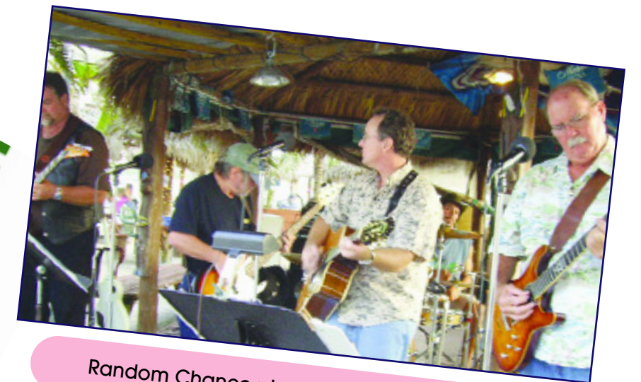
Random Chance playing at Gilbert's Resort.