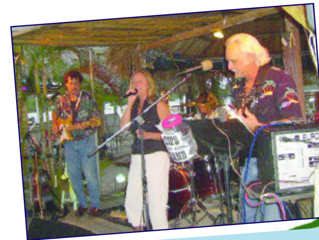
Sol Expressions entertaining at Gilbert's Resort.