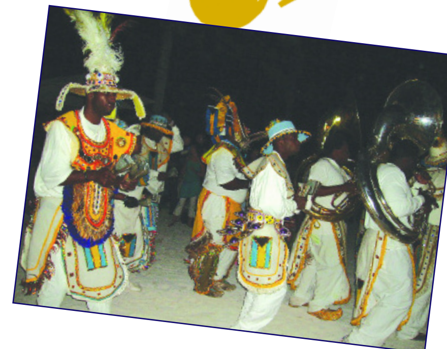
Bahamian Parade making their rounds at Morada Bay's Full Moon Party.