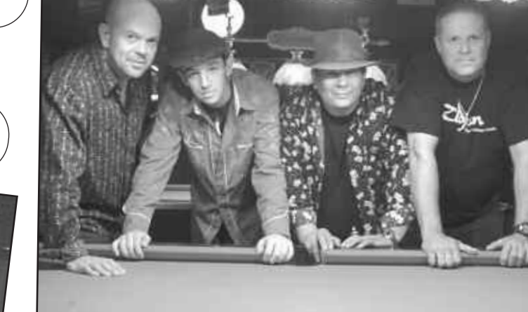
The band Snaketie plays at Gilbert's Resort.