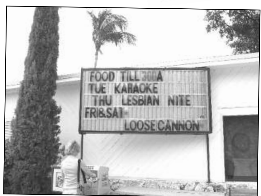
Wonder what the music is like on Lesbian Nite at the Big Fish?