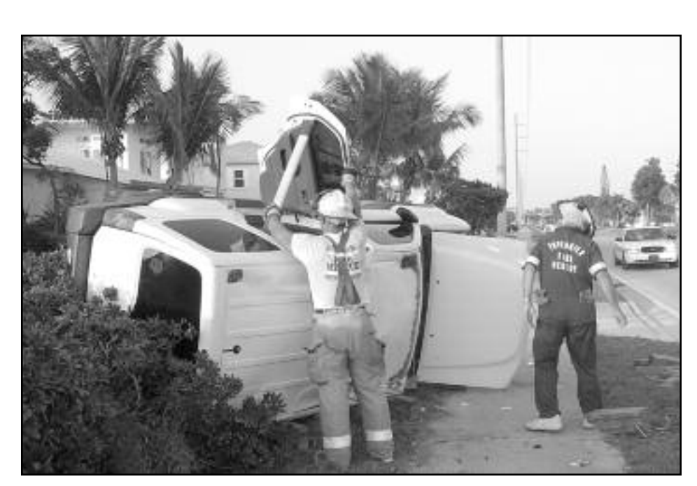
Black and Blue and Gonzo All Over

Not having been seen out at my usual watering holes since the wreck, rumors of my demise have been significantly exaggerated. So to lay them to rest I caught a few happy hours yesterday - one at the Pilot House, another at the O.V. and another at The Whistle Stop. I figured that if the bartender served me that I must still be alive and if I weren't serviced. well then, the rumors are not rumors and that the gonzo spirit is just too darn stubborn to move over to the next dimension. I am relieved to report a substantial buzz. gOnZ