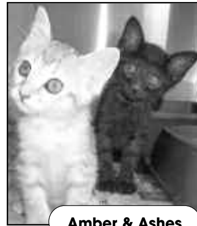
Amber & Ashes