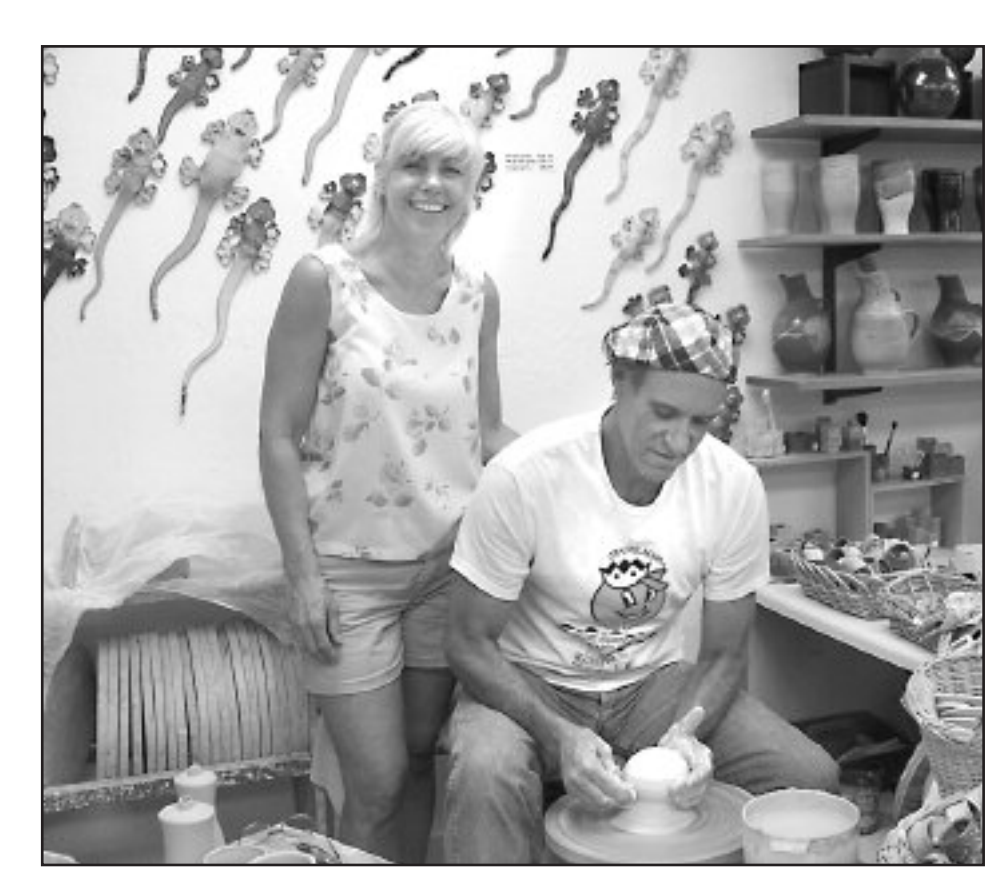
Story and photos by Rachel R. Peine

Before you even enter Bluewater Potters, your senses are aroused by the handmade ceramic door handle, glazed with the glowing turquoise of the waters of the Keys. Once inside, the colors strike you even more strongly, combined with designs of our local geckos, fish, and turtles adorning mugs, candleholders, lamps, and toothbrush holders.