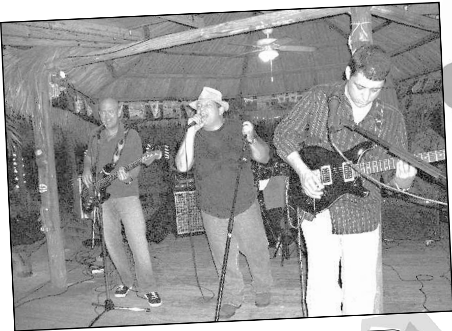
There is always great music at Gilbert's Resort.