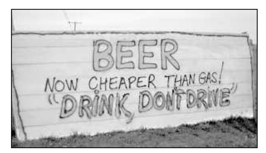
This "Sign of the Times" is on a lawn in Jamestown, New York.