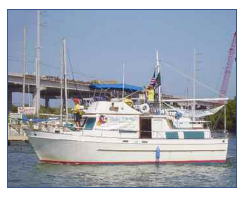
Pirates on the Water headed a bridge opening boat parade.

The next time you're heading off the rock, enjoy the view and