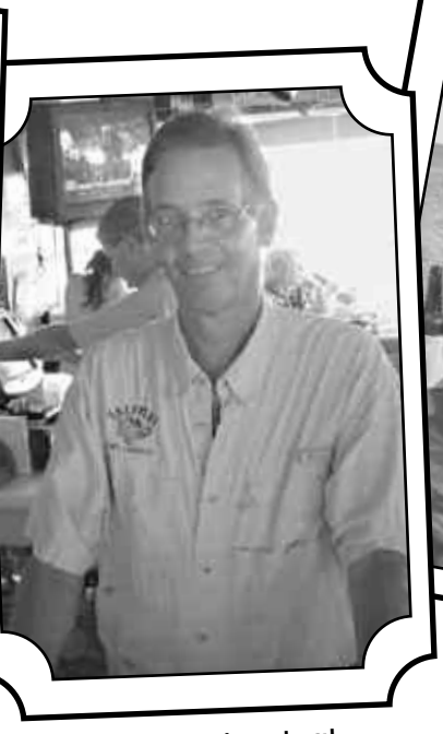
Dicko is back at Snappers!