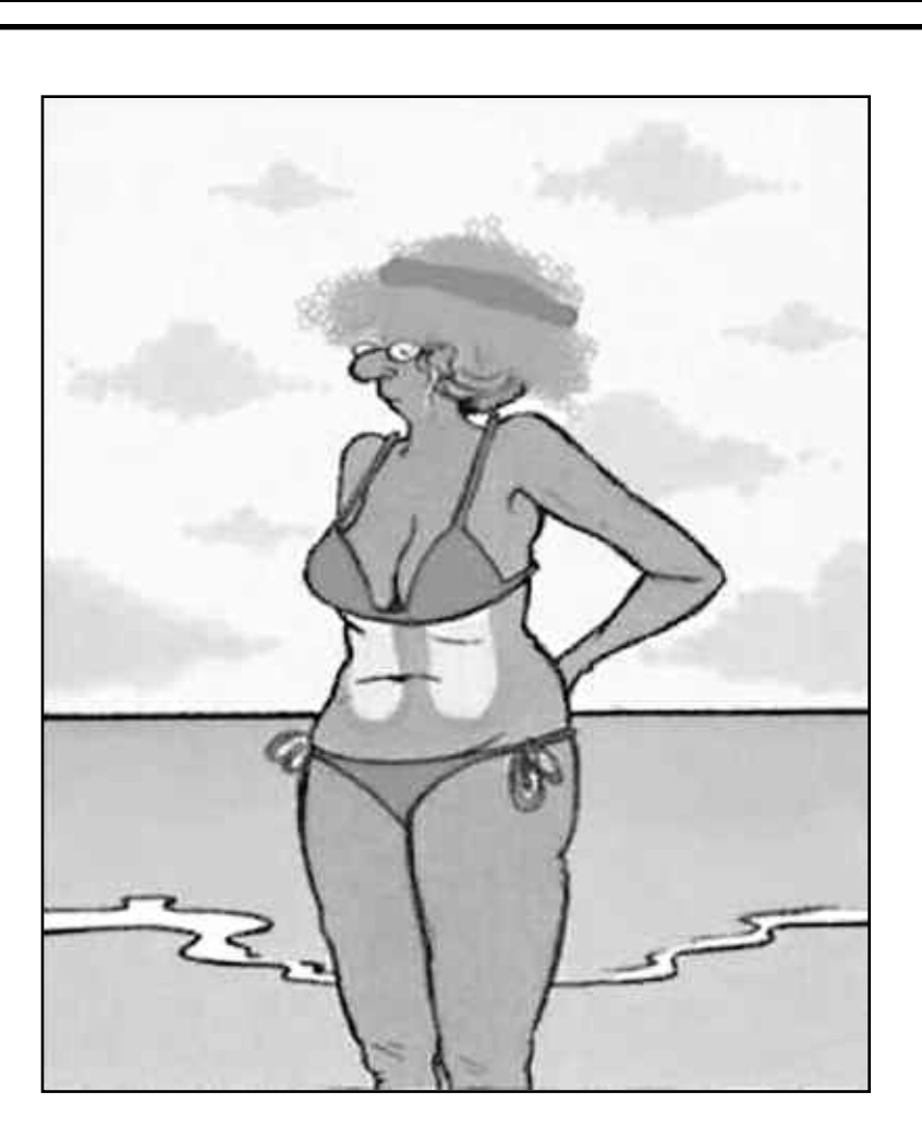
Why Older Women Should Not Sunbathe in the Nude