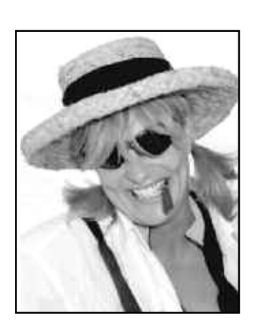
By Sammie Mays aka The Gonz

If it looks like a duck, walks like a duck, and quacks like a duck, it's probably one of those obnoxious rubber chickens.