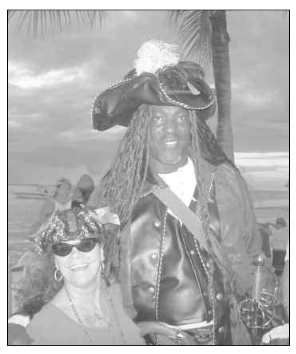
Black Caesar poses with one of his wenches