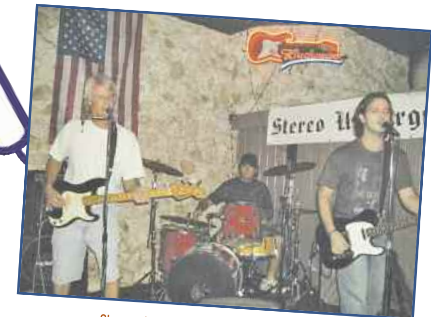
Stereo Underground at Coconuts.