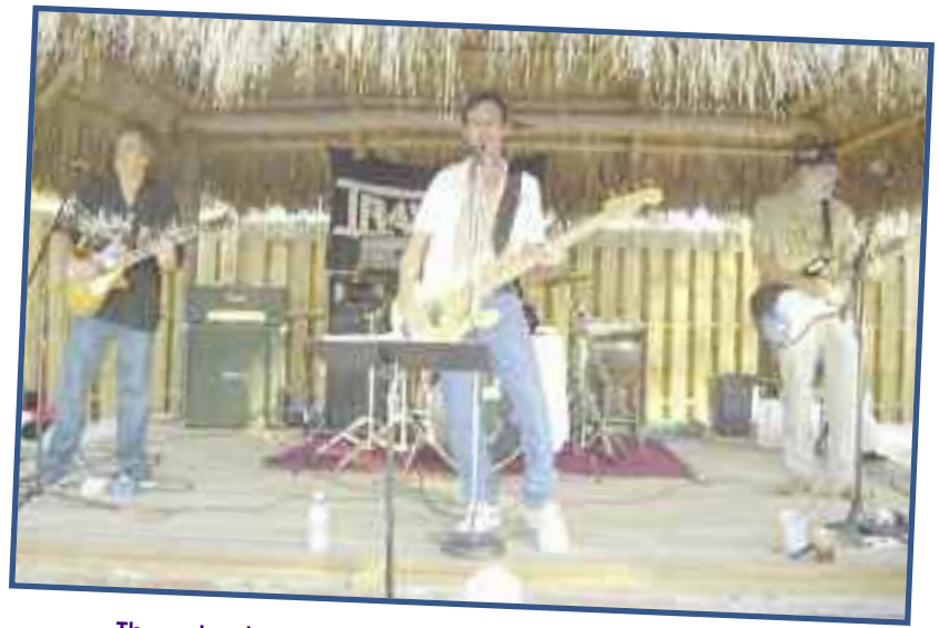
There is always great entertainment at the Big Chill.