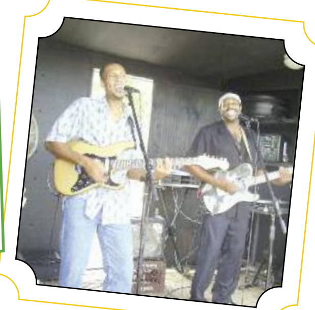
Superb reggae at Snappers.