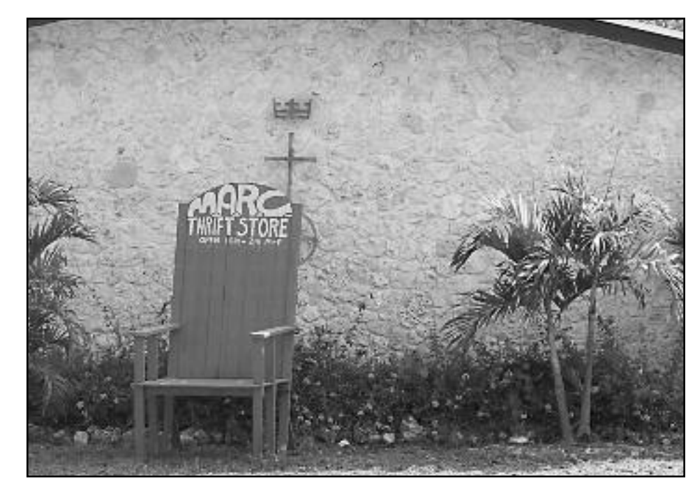
Turn at the big red chair and shop for sales while helping out fellow members of your community.

whose homes were under water. So, you can feel good that you helped in that relief effort by supporting the store. The Key Largo store is open Monday through Friday 9:00 - 4:00 and Saturday 9:00 - 3:00, 100109 Overseas Highway, Oceanside.