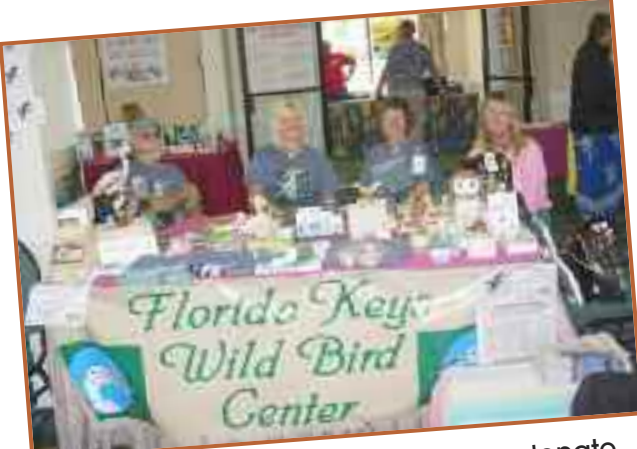
These volunteers donate their time to raise much needed funds for the Wild Bird Center.