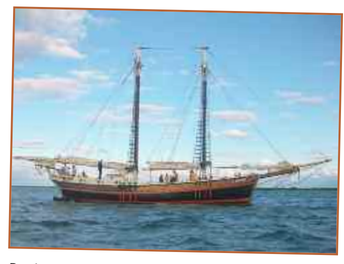
Pontune's newly acquired Pirate Ship is docked at Gilbert's Resort.