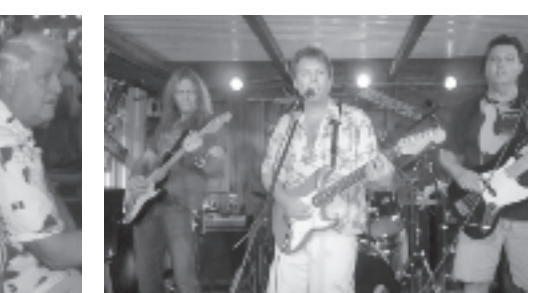
Blackwater Sound Reunion rocked