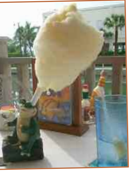
Lunch at Senor Frijoles includes free cotton candy in a frog holder!