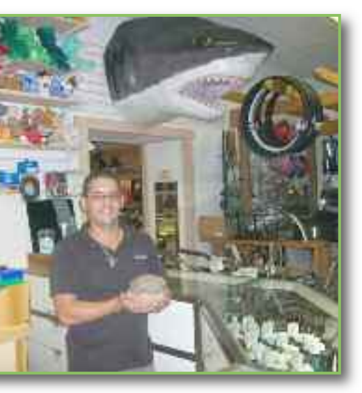
Looking for a unique gift for that hard to buy for person? Maybe a petrified dinosaur egg, pre-owned Rolex watch, treasure coins, musical equipment, or a bike? Coral Financial at mile marker 103 also has everything from tools to generators, jewelry and even a concrete cannon. Stop in and