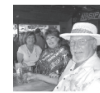
Bory and Balph lent their support