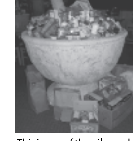
This is one of the piles and piles of food items donated