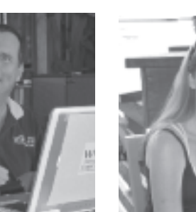
kept everything running in the house! smoothly