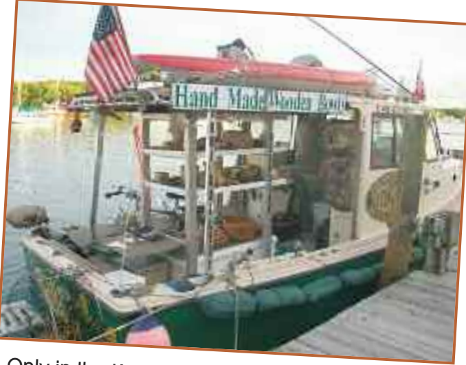
Only in the Keys.... The captain of this boat was selling hand made exotic wooden bowls at Gilbert's Resort.