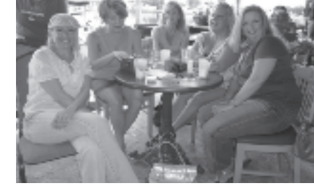
The dolphin ladies partied with a porpoise!