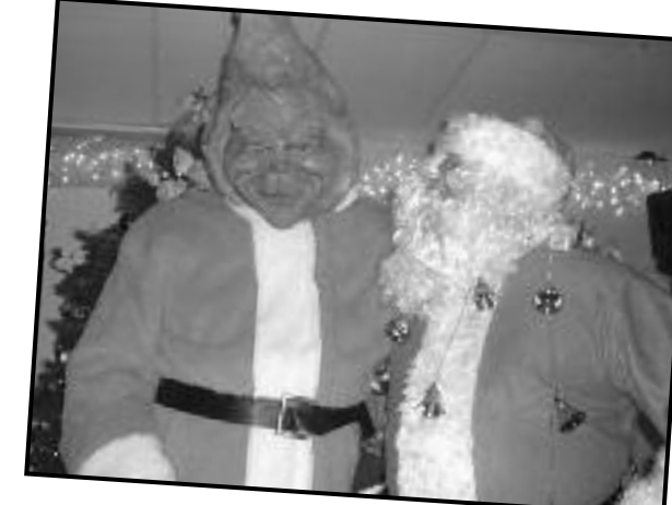
The Grinch meets Santa at the Key Largo Moose.