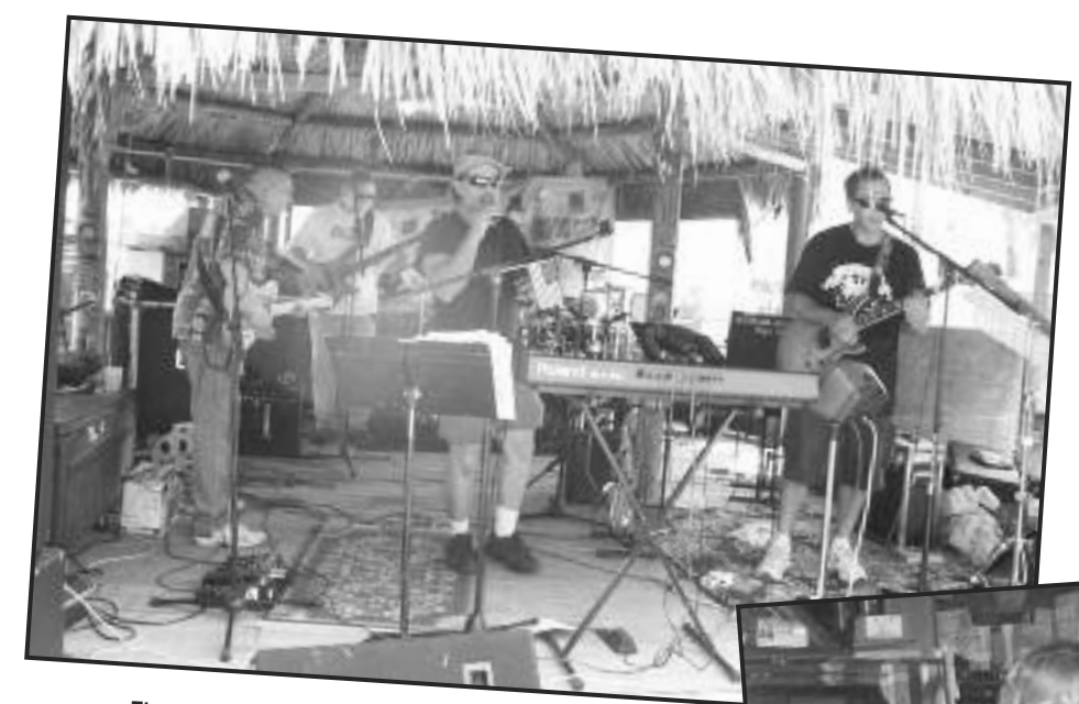
The Mosquito Heads are awesome at Gilbert's Resort.