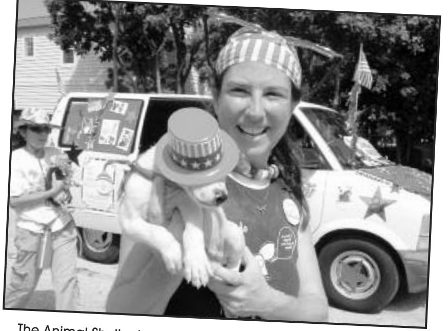
The Animal Shelter had some cute furry friends at the parade.