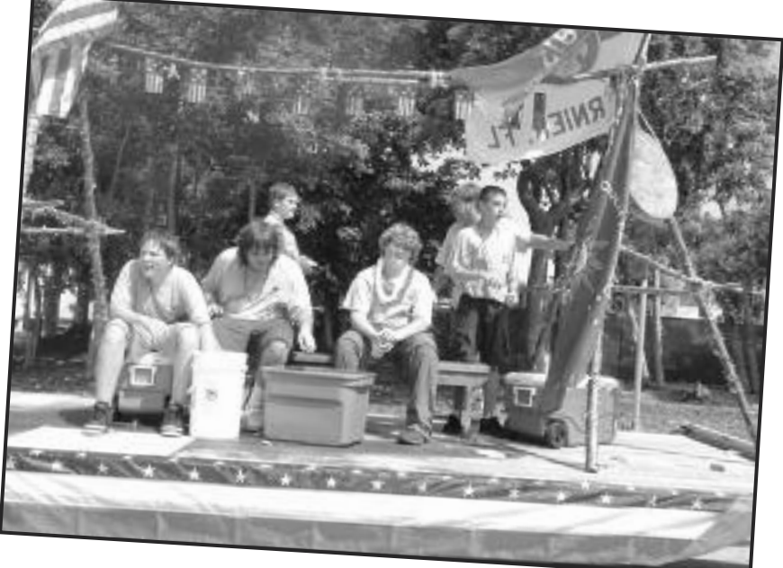
The Boy Scouts.