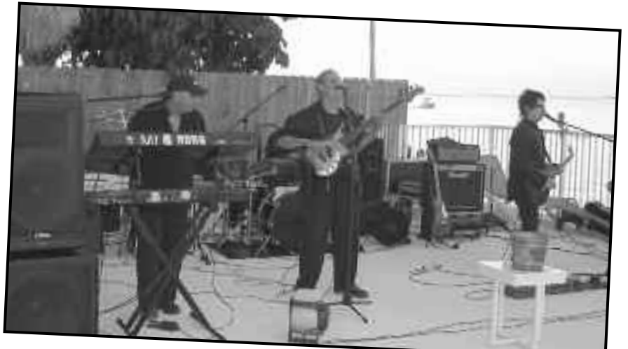
Viva entertaining the crowd at the Big Chill.