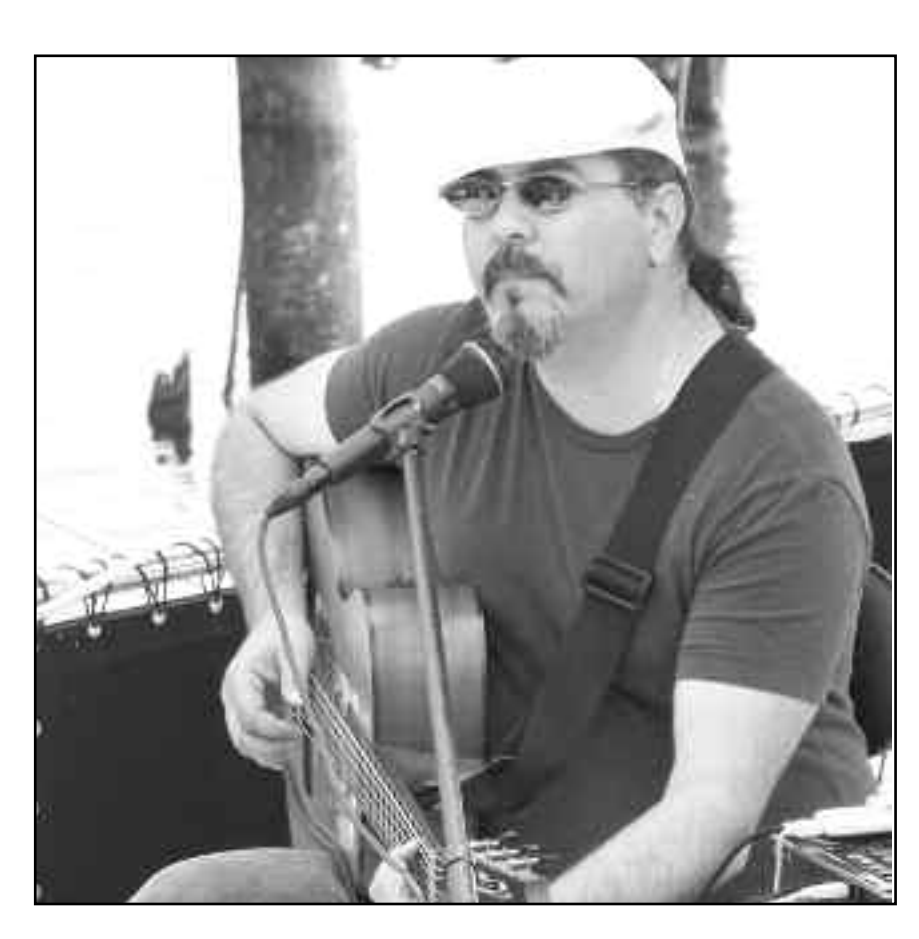
By Rachel R. Peine

It's Sunday morning (well, actually around 1:00 in the afternoon), and pelicans are gliding down to the pilings near the dock at Snapper's. The aura at the patio tables and outside bar has that easy, mellow feel of people taking their time to enjoy the bloody marys, the ocean, and the relaxing sound of Frank Carmelitano's jazz guitar.