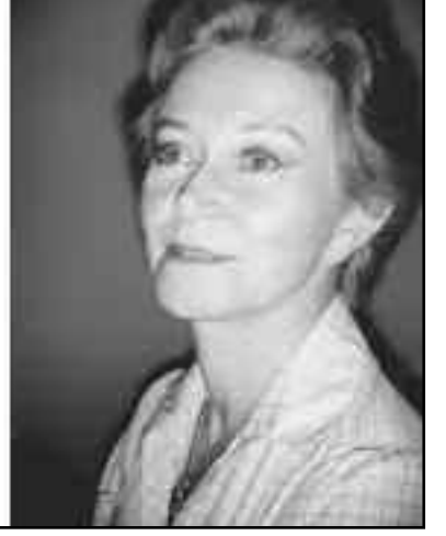
Amazing results, satisfied clients!