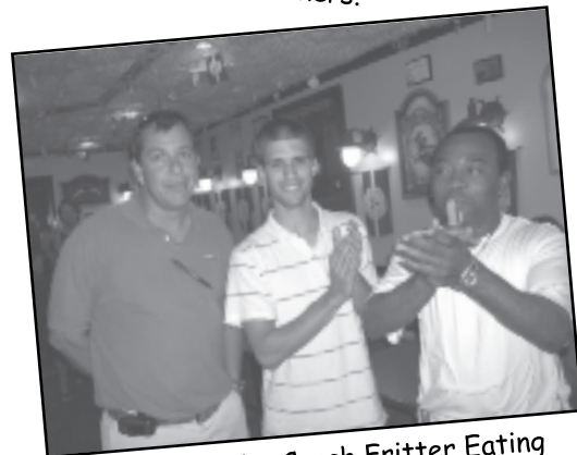
Winners of the Conch Fritter Eating Contest at the Fish House Encore.