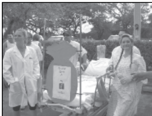
Mariners Hospital's Pineapple Express Team