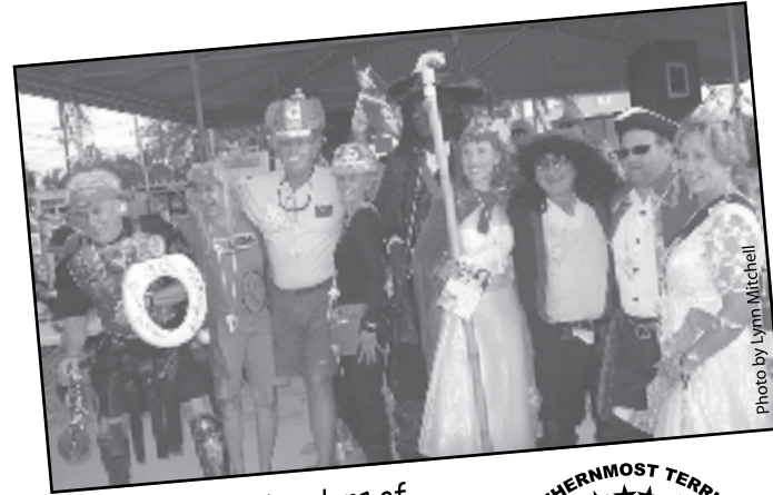
The Fearless Leaders of the new Republic at their installation at Sundowners.