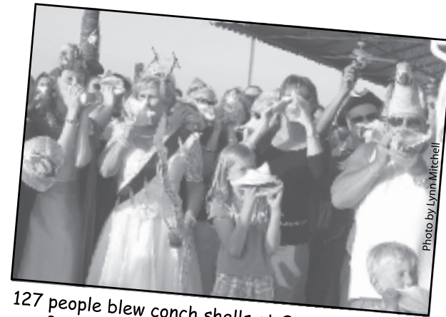
127 people blew conch shells at Sundowners in a Guinness Book of World Records attempt.