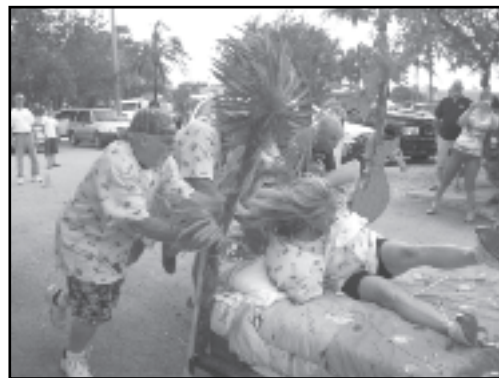
Rotary Bed Bugs Team