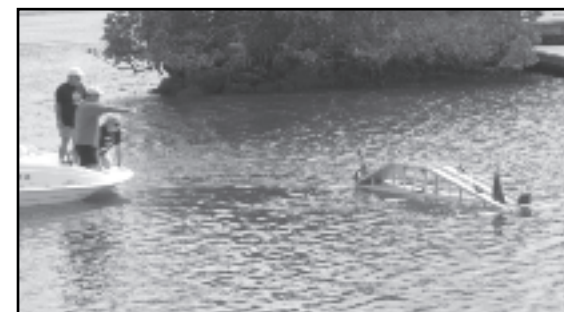
Preparing to "Blow the Bridge" at Snapper's