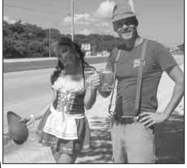
Oktoberfest was a big hit at the Key Largo Conch House!