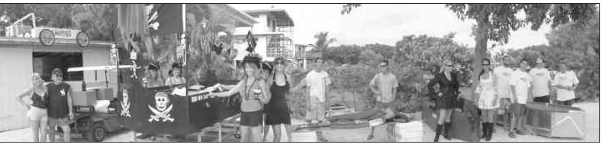
"Anything That Floats" group shot.