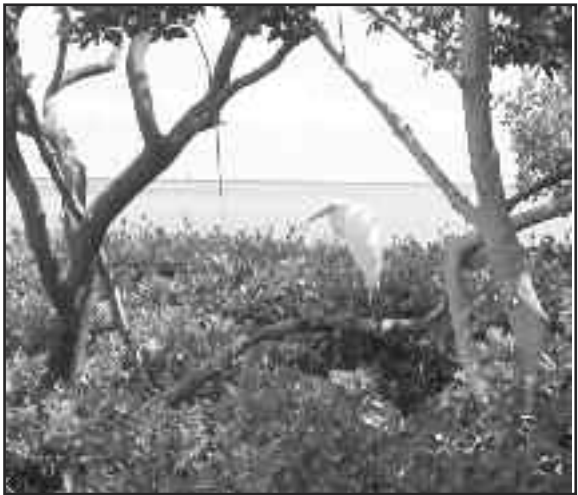
Coconut Telegraph votes Island Grill as best breakfast in Islamorada!

P.S. Don't forget The Coconut Telegraph is FREE too!