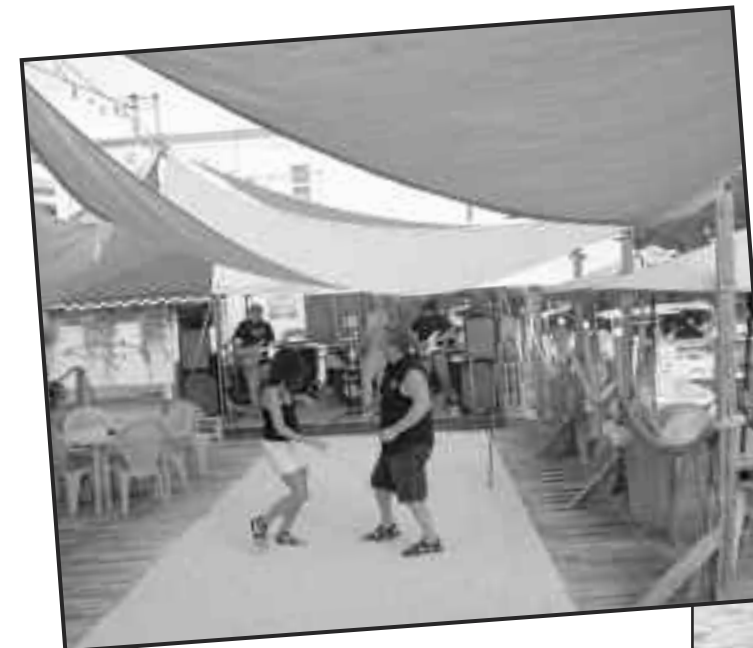
Dancing to "Night Shift" at Marley's.