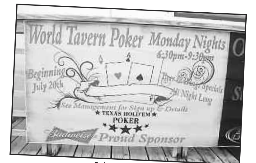
Poker at Coconuts.