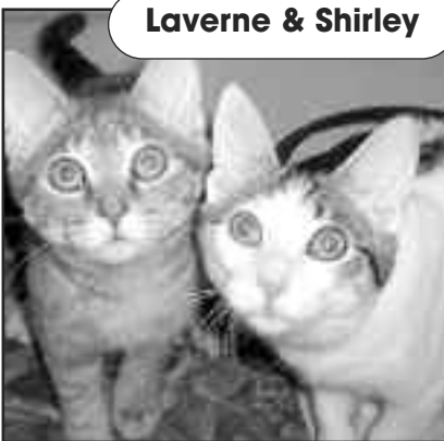
Laverne & Shirley