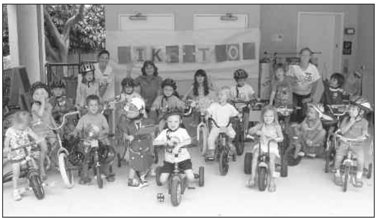
St. James children line up with their bikes for bike safety awareness.

The Trike a Thon program is sponsored by the National Association for the Education of Young Children (NAEYC),