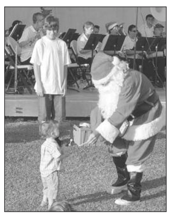
Santa Visits Band Concert at Founders Park

Bring family, friends, and a blanket or lawn chair to enjoy the free Pops in the Park concert. For more information, call (305) 853-7294, e-mail keysconcertband@aol.com, or find the Band on Facebook.