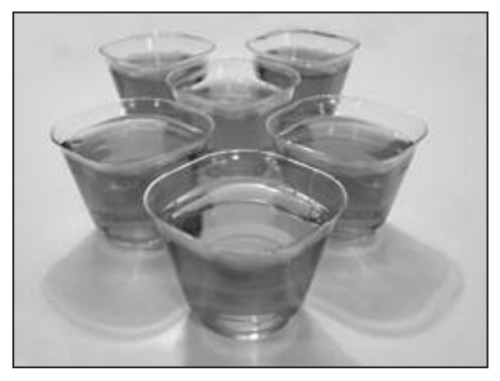
The first Jell-O Shot concoctions dates back to 1862 and was called Punch Jelly.

Please drive responsibly or call Mom's Taxi