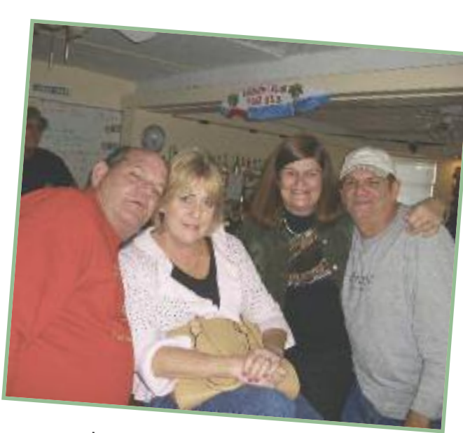
he gang at the new Legion.