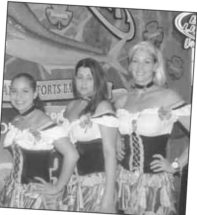
St Patrick's Day Party at D-Hooker.