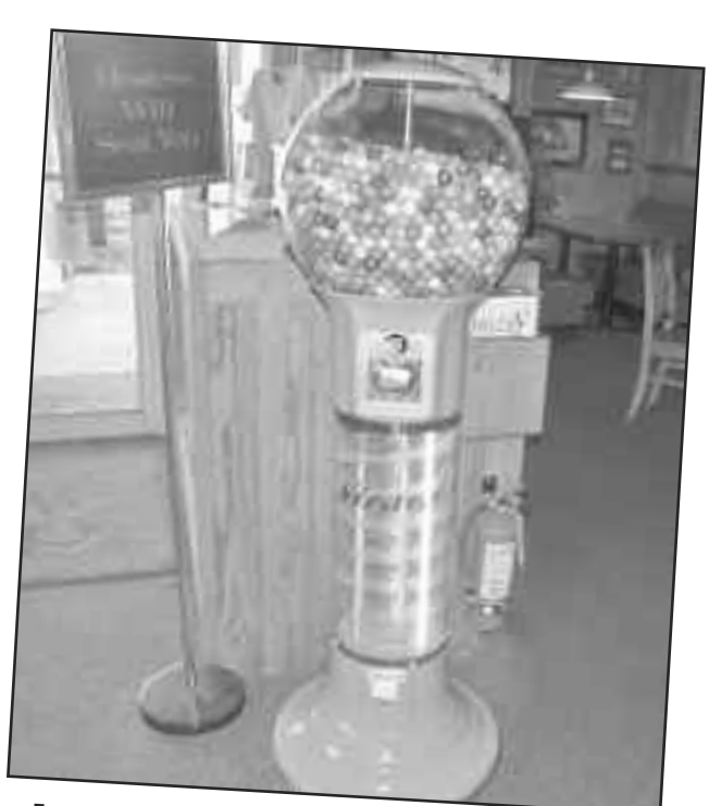
From the minute you arrive, Chilli Willies is super kid friendly.