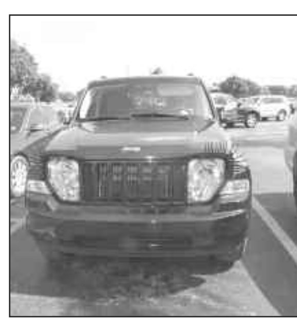
Find these accessories at CarLashes.com - rhinestone eyeliner is also available.