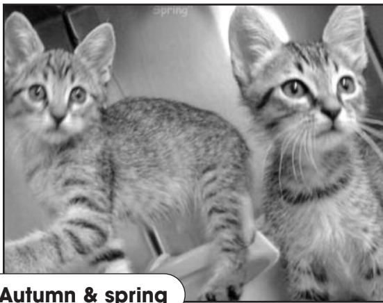
Autumn & spring