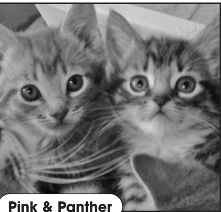
Pink & Panther