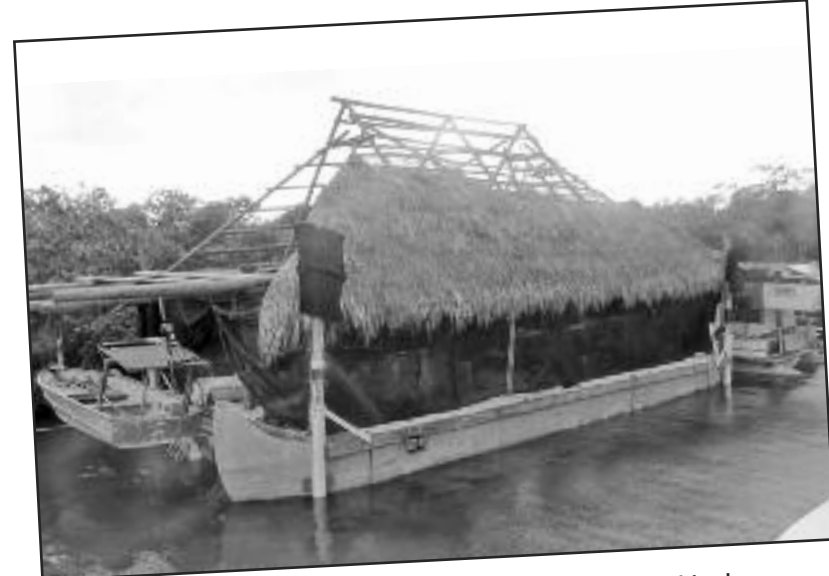
Quite the party barge or floating home found below Jewfish Creek Bridge.