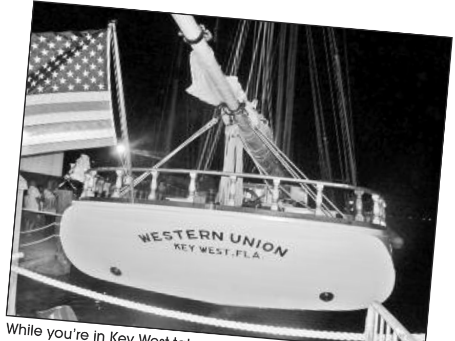
While you're in Key West take a ride on this boat... One of the last "tall" ship still sailing from the Island.