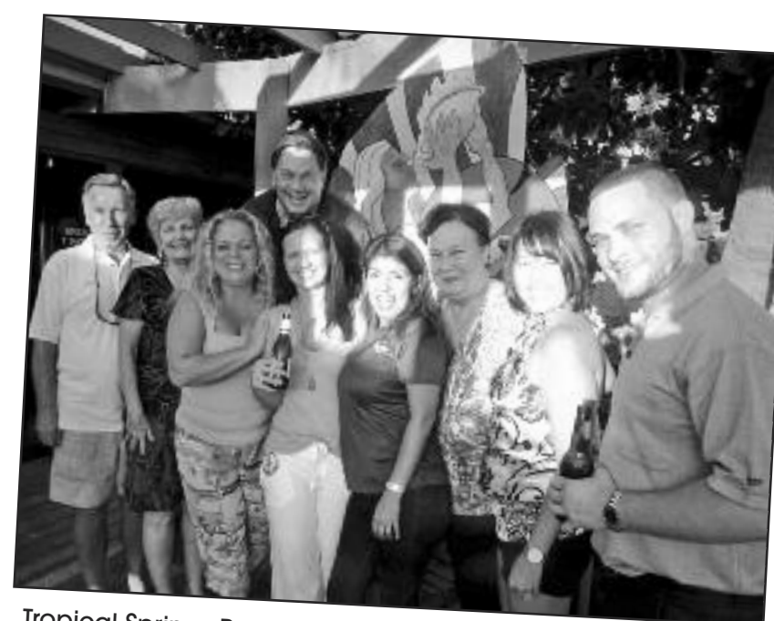
Tropical Springs Realty having a great party at Sundowner's.