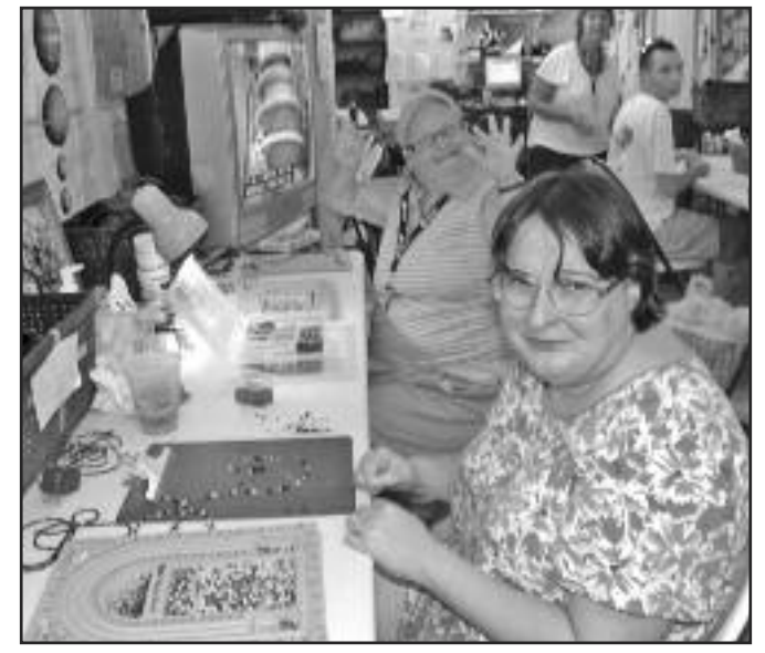
Members of MARC making jewelry. The handcrafted jewelry is for sale and funds benefit the program.