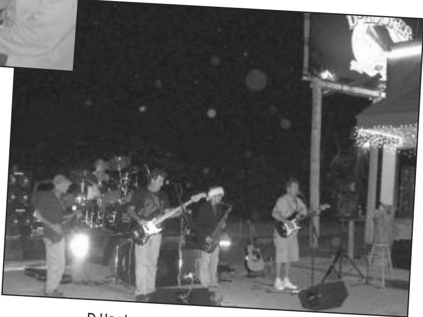
D-Hooker now has live entertainment!