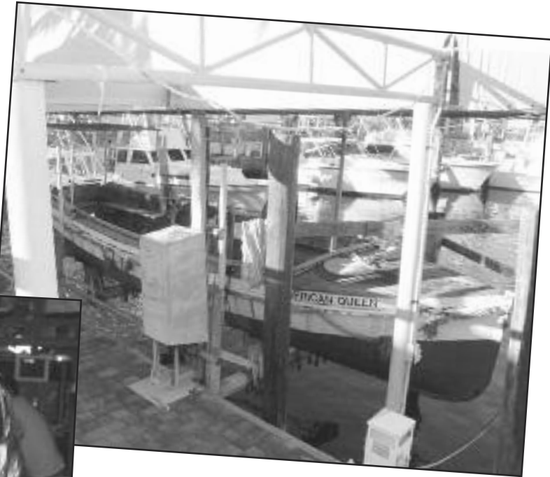
Docked next to the Key Largo Princess at the Holiday Inn, the famous African Queen is a Key Largo "must see."