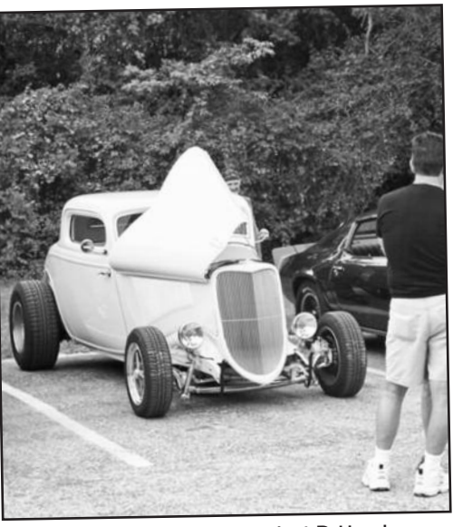
A recent car show held at D-Hooker.