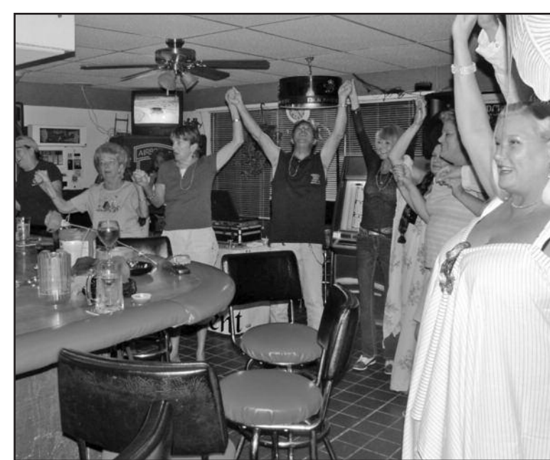
Most patriotic organization in the Upper Keys, the VFW.