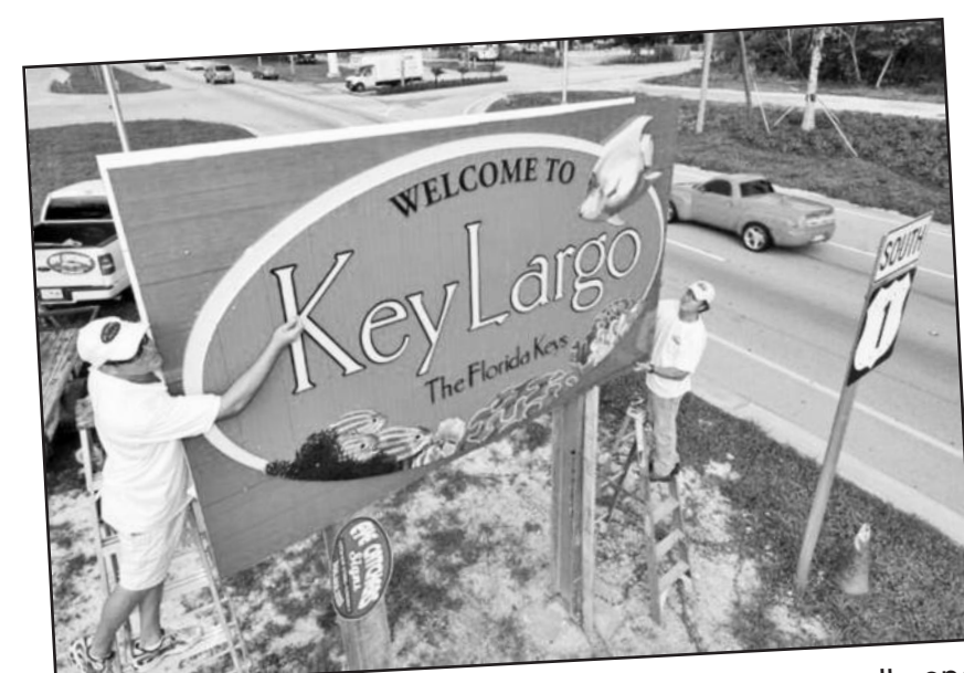
The new, beautiful welcome sign in found at the north end of Key Largo.