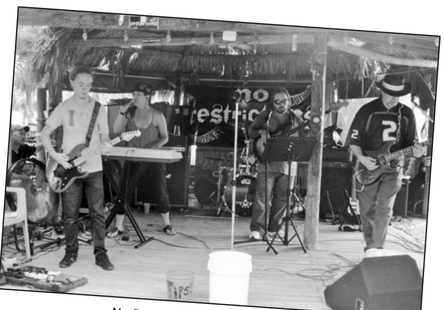
No Restrictions at Gilbert's Resort.