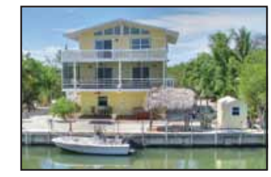
HIGH END EXECUTIVE STYLE HOME IN STILLWRIGHT POINT - 3/3 plus garage on canal with direct access to the bayfront. Room for a large family.

BEAUTIFUL DOUBLE WIDE on a huge corner fenced lot. 1991, so easily financed. Well maintained with 3 bedrooms, 2 baths! Open living plan, plus a large attached screened porch and patio area. Mature trees give lots of shade. This property is a great investment or a wonderful home for your family. No fixing here! Near Key Largo schools. $179,500.