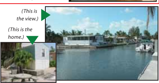
CANAL FRONT MOBILE HOMES concrete dock and near the bayfront. One in Sexton Cove for $174,900 and one with owner financing in Key Largo Trlr. Village for $255,000

Tropical Springs Realty • In Business Since 1974 • Serving 5 Counties