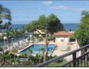
TAMARIND BAY - FOR SALE AND RENT - nice views and sunsets from the fully furnished unit. Gated entrance. Protected canal deepwater dockage, 2 pools, tennis and boat ramp.