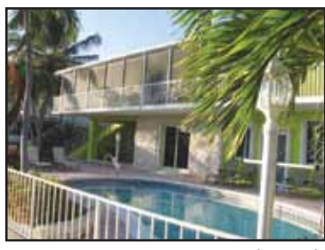
PORT LARGO POOL HOME - short sale - magnificent 4 bedroom home 3 baths Gourmet kitchen. Travertine floors, many upgrades and custom details. Very spacious. Call Jane or Wendy.