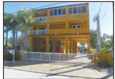
SALE OR RENT - exquisite large property with 180' dockage; bay views from every room; 9 bedrooms. Large in-ground pool, outdoor kitchen, upgrades, and all the luxury amenities!!