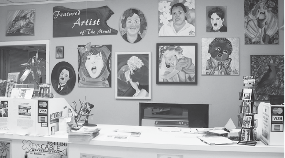
The Art Box features a different artist each month. Stop by (MM 101.6)!