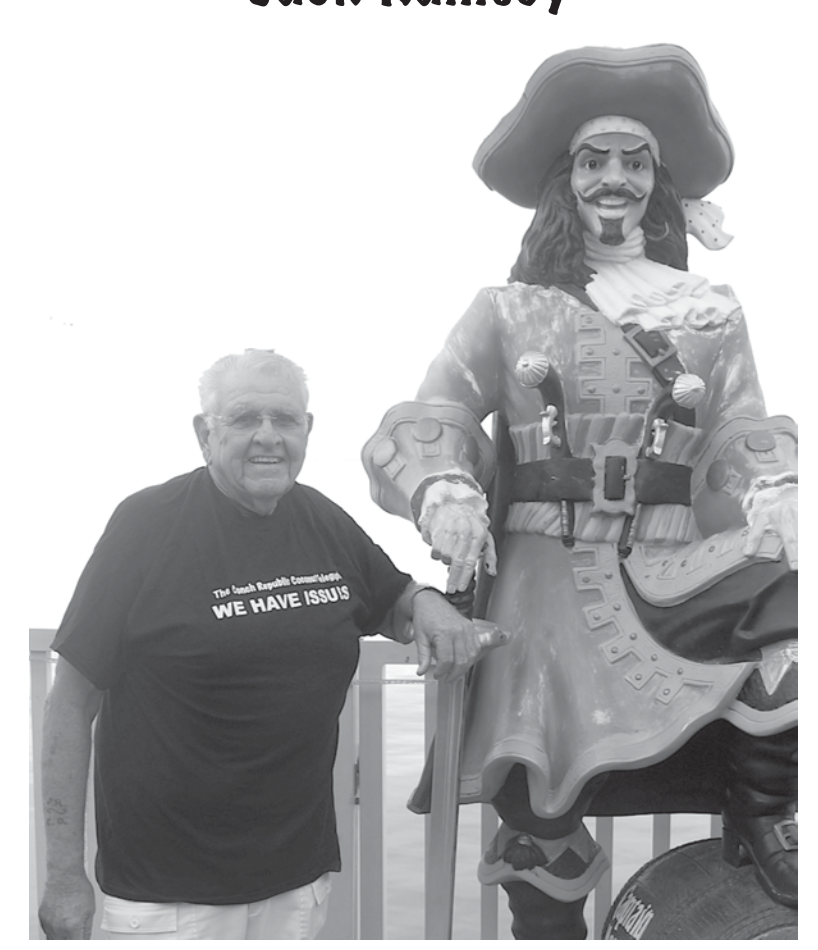
Shirts by T-Toons