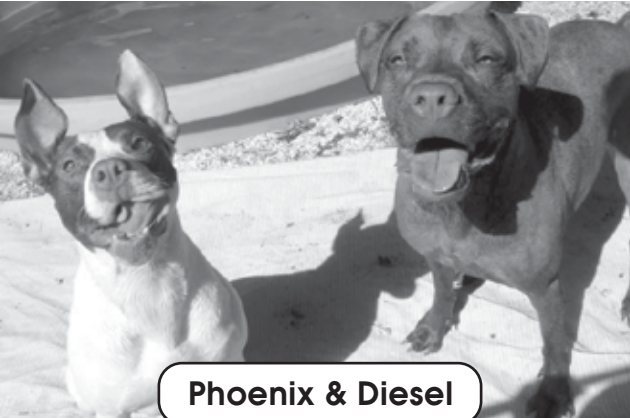
Phoenix & Diesel