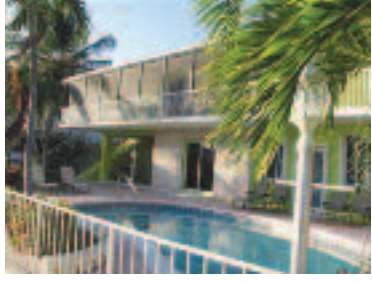
PORT LARGO POOL HOME - short sale - magnificent 4 bedroom home 3 baths Gourmet kitchen. Travertine floors. many upgrades and custom details. Very spacious. Call Jane or Wendy.

Tropical Springs Realty • In Business Since 1974 • Serving 5 Counties