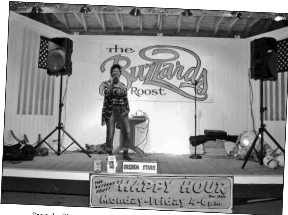
Brenda Starr every Saturday night at the Buzzard's Roost.