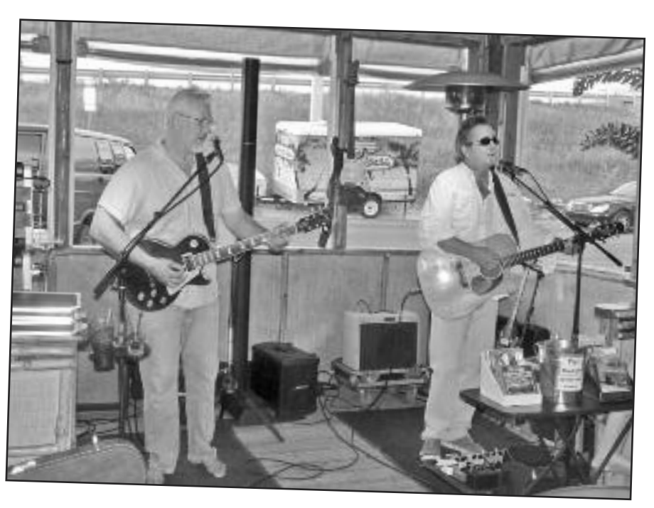
Great entertainment at the Island Grill.