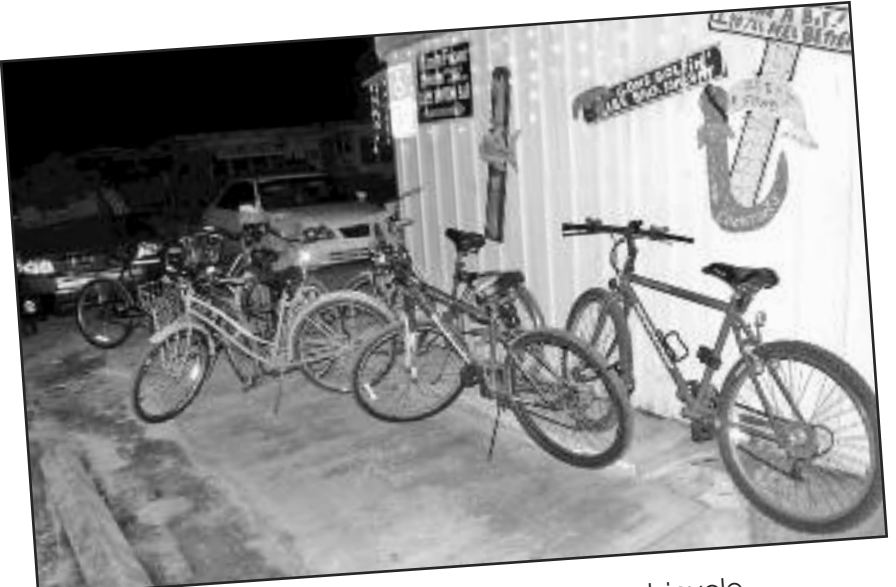
Visit the Pilot House by boat, car or bicycle.