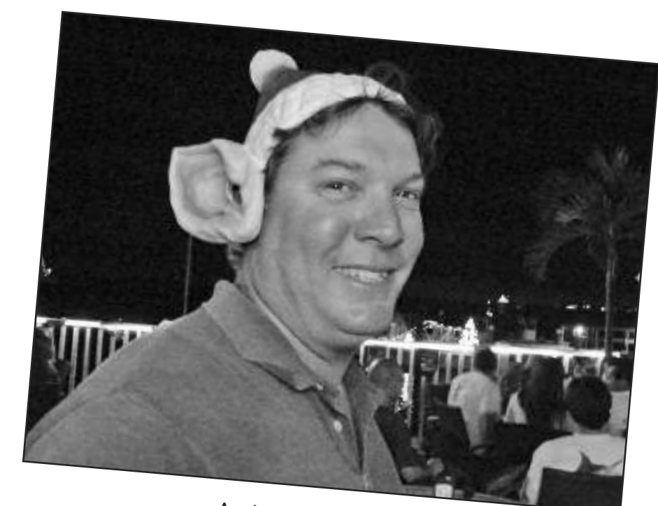
Avatar at the Big Chill?