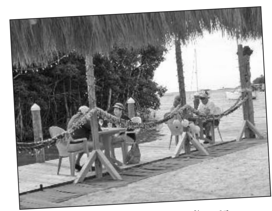
Romantic dining on the water at Steamers.