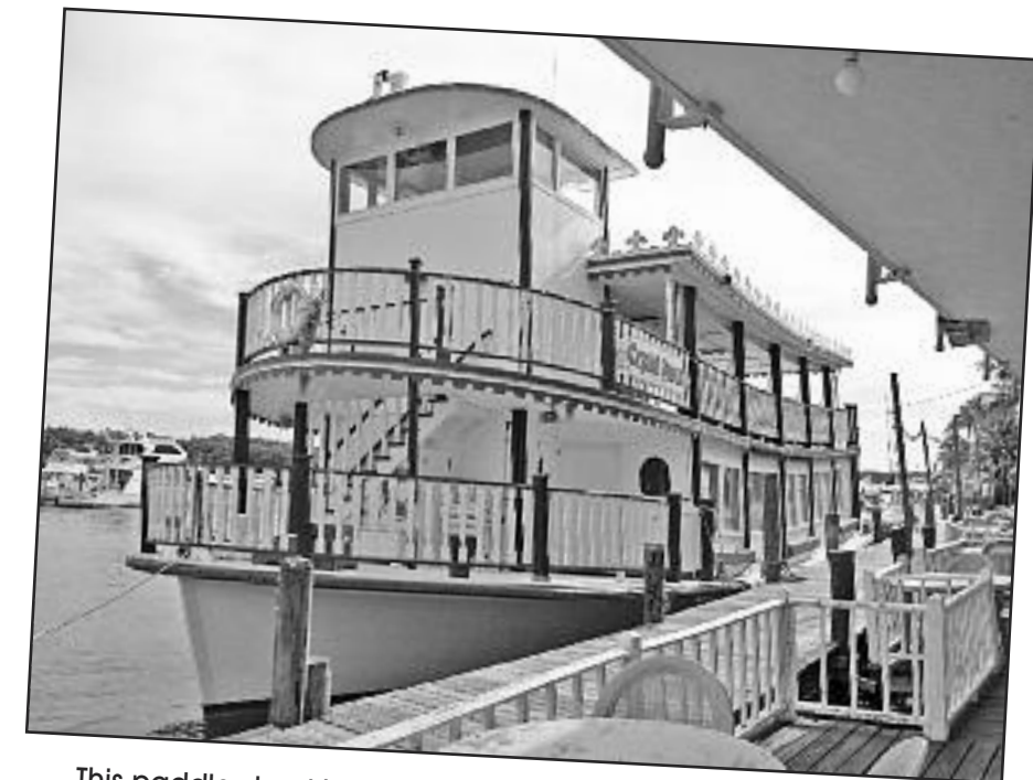
This paddlewheel boat leaving from Gilbert's will be taking dining tours very soon.