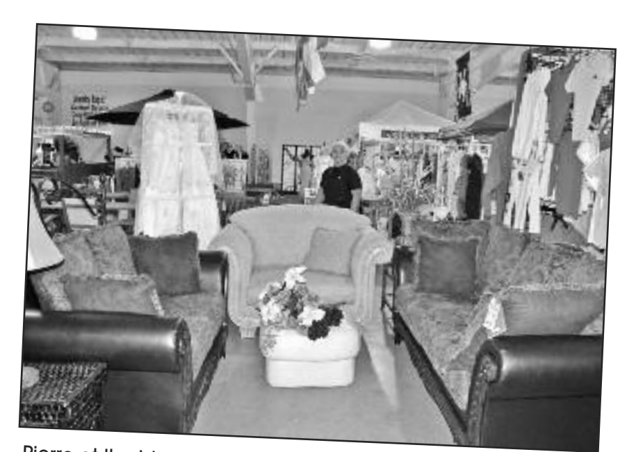
Pierre at the Island Market displays beautiful used furniture on consignment.