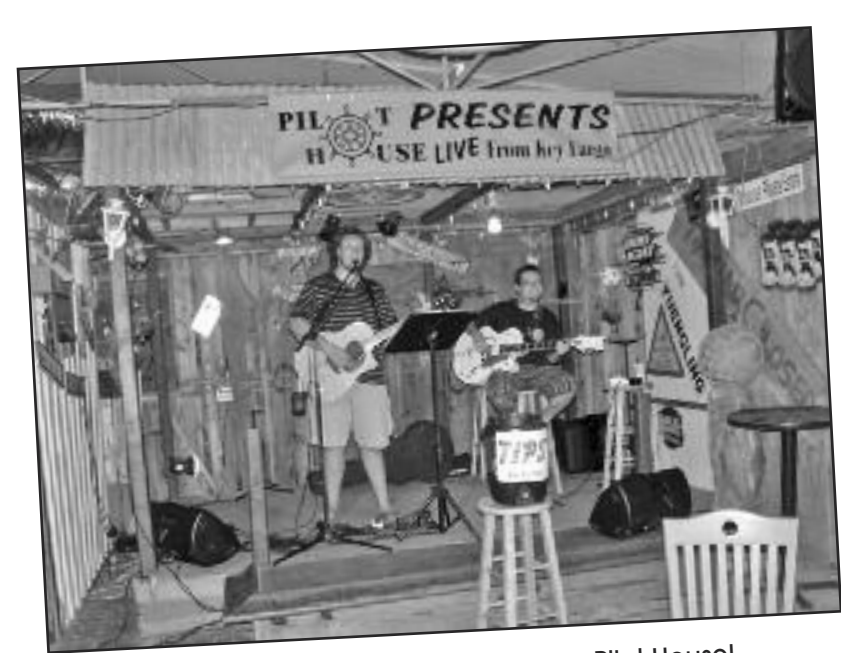
Always great entertainment at the Pilot House!