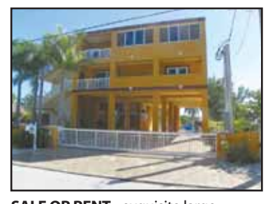
SALE OR RENT - exquisite large property with 180' dockage; bay views from every room; 9 bedrooms. Large in-ground pool, outdoor kitchen, upgrades, and all the luxury amenities!!