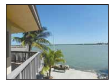
BAYFRONT HOME FOR RENT - available June 15th, annual basis. Private location. 3 bedroom, good dockage. Furnished.