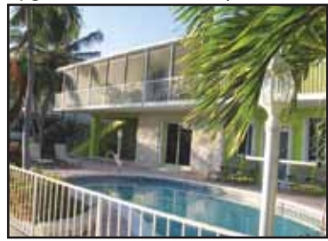
PORT LARGO POOL HOME - short sale - magnificent 4 bedroom home 3 baths Gourmet kitchen. Travertine floors, many upgrades and custom details. Very spacious. Call Jane or Wendy.