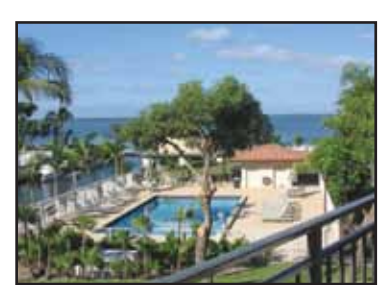
TAMARIND BAY - FOR SALE AND RENT - nice views and sunsets from the fully furnished unit. Gated entrance. Protected canal deepwater dockage, 2 pools, tennis and boat ramp.