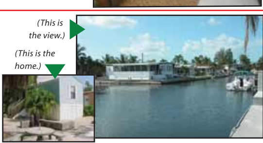
CANAL FRONT MOBILE HOMES concrete dock and near the bayfront. One in Sexton Cove for $174,900 and one with owner financing in Key Largo Trlr .Village for $255,000