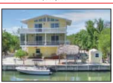
HIGH END EXECUTIVE STYLE HOME IN STILLWRIGHT POINT - 3/3 plus garage on canal with direct access to the bayfront. Room for a large family.