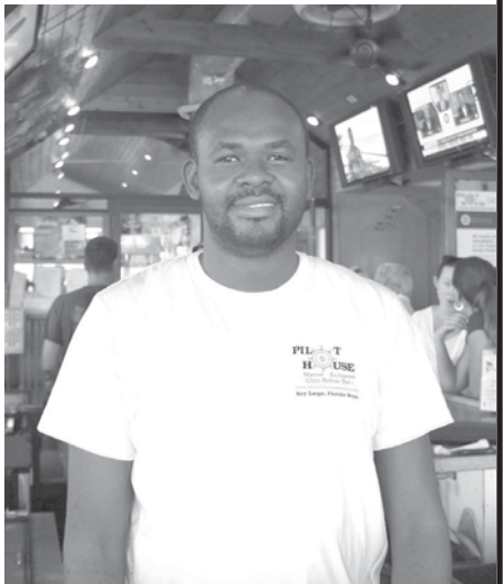
Congratulations DJ on your promotion at the Pilot House!