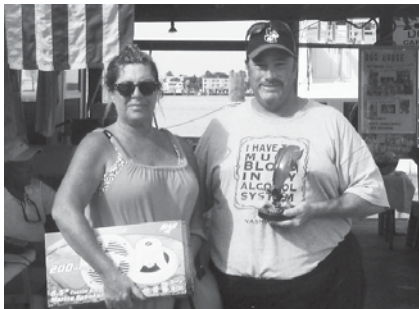
3rd Place: REEL McCOY