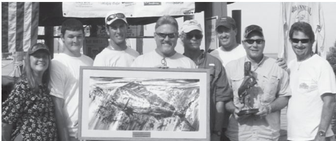
1st Place Team: CONTAGIOUS

The captioned tournament hosted 36 anglers, on June 2nd and 3rd. "This tournament has a unique format" stated tournament director Dianne Harbaugh. "The boats enter as teams with the combined weight of 3 dolphin determining the winners. Only 2 fish can be weighed per day but it takes 3 to win." After the first day of weigh-ins at host location Whale Harbor, the charter boat "Contagious" was in the lead.