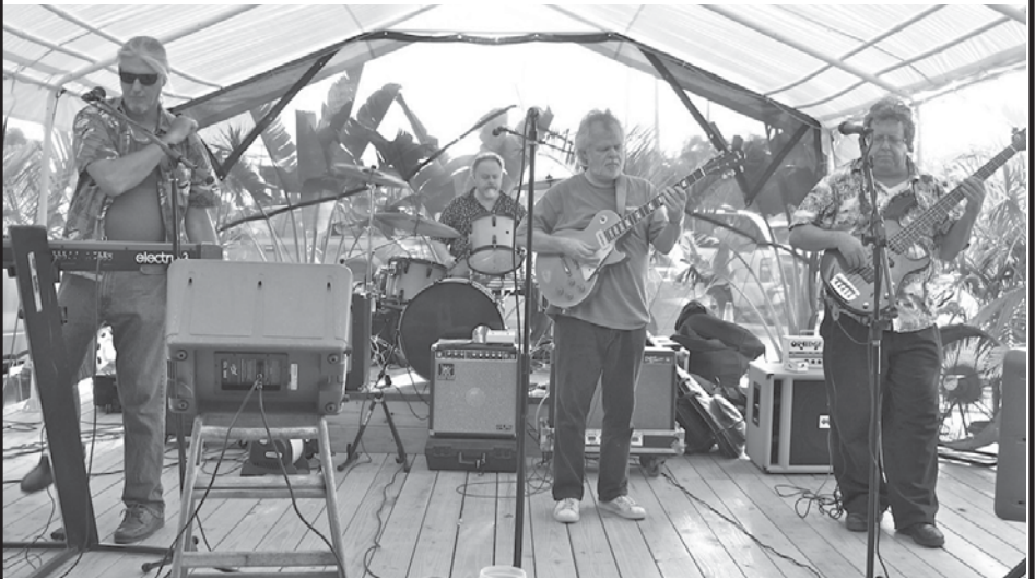
"The Whipping Post" band at Gilbert's