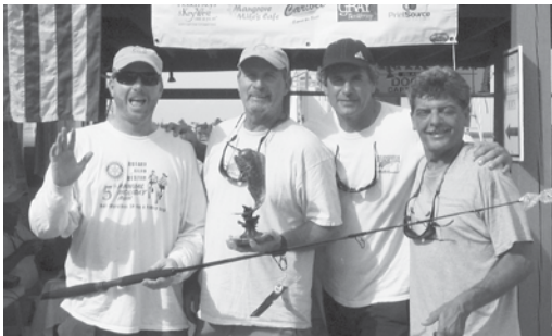
2nd Place Team: TIKI

Other sponsors included Coastal Angler Magazine, Print Source in Islamorada, Barefoot Bait and Fishing Services. The Islamorada Charter Boat Association thanks all involved for helping to support fishing in the Fabulous Florida Keys!